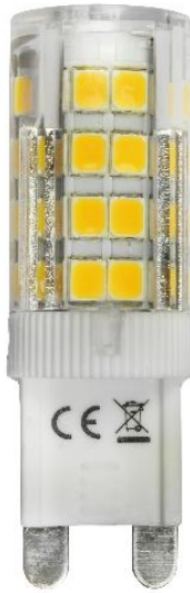
G9 Flat 2-Pin Base